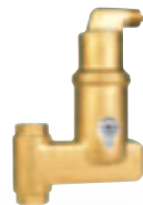
Brass, vertical: 22 mm up to 1"